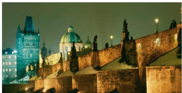
Charles Bridge by night

Cost contribution per person (ESP Member): EUR 10 Cost contribution per person (Non-ESP Member): EUR 50